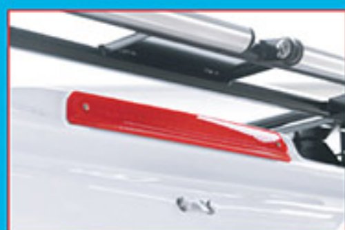
High Mounting L.E.D. Brake Light.