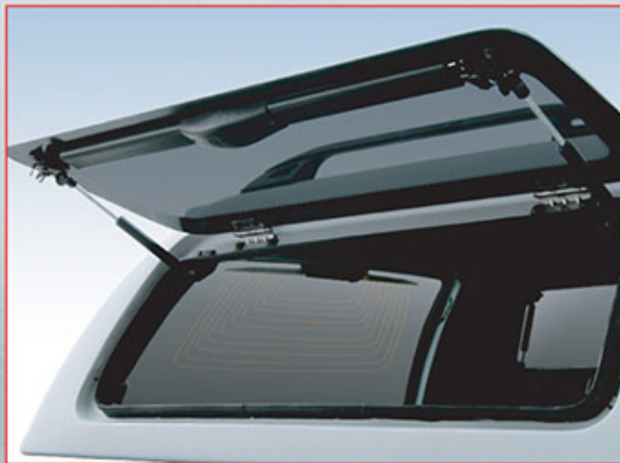
Rear Door handle