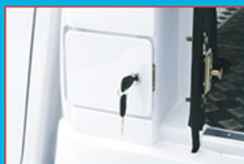
Fuel Flap with Lock & Key