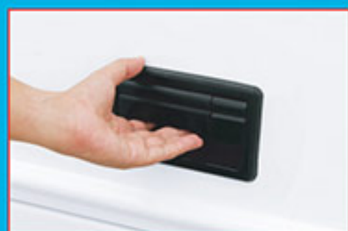
Door Handle with Lock & Key