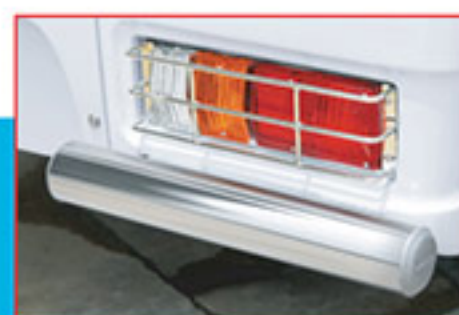
Stainless Steel Bumper Bars & Tail Light Covers