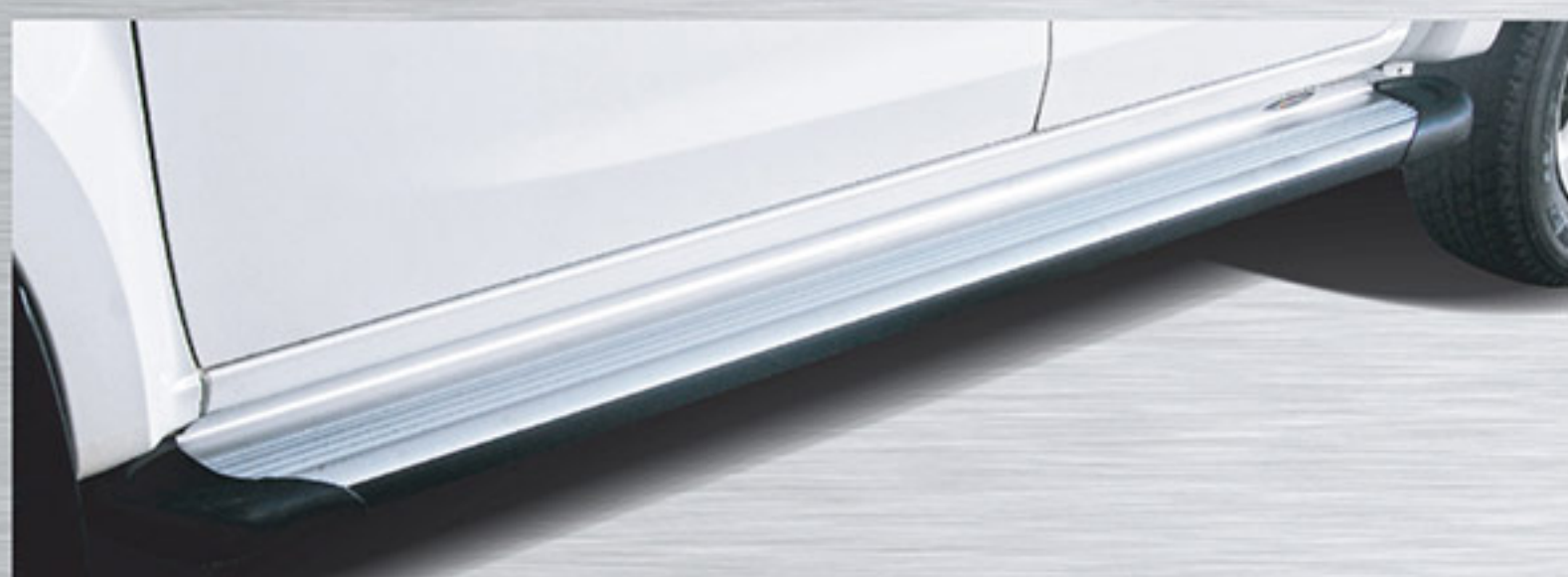
CB-551 — Set Aluminium side step available in 68", 73", 78" and 85" length.