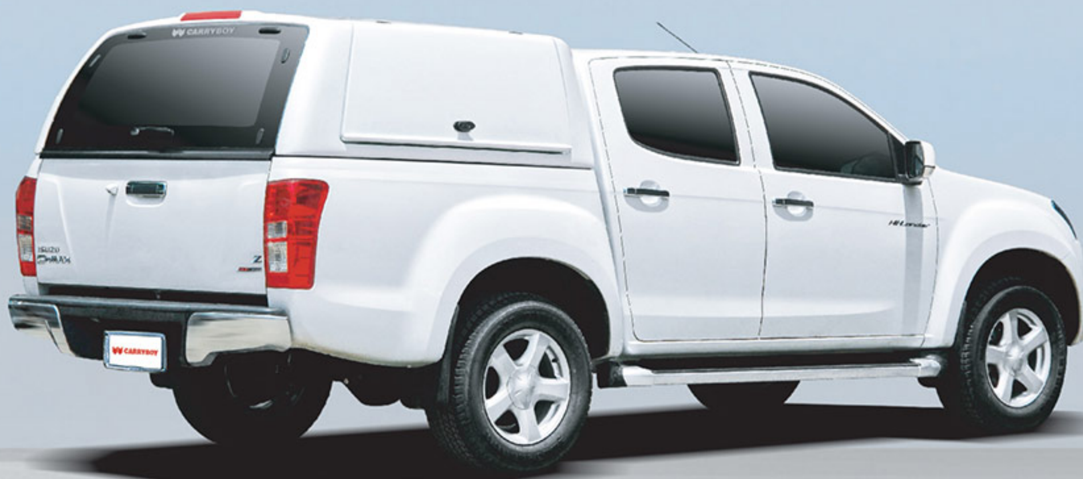
CIRD-WM / Double Cab

A commercial and work style canopy with side fiberglass lift up doors. Interior carpet lining and temper tinted rear door glass. (1 key operation for 3 doors)