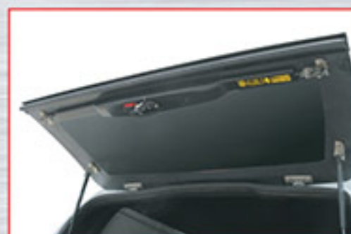
Tinted Rear Door Glass with smooth pressure gas struts.