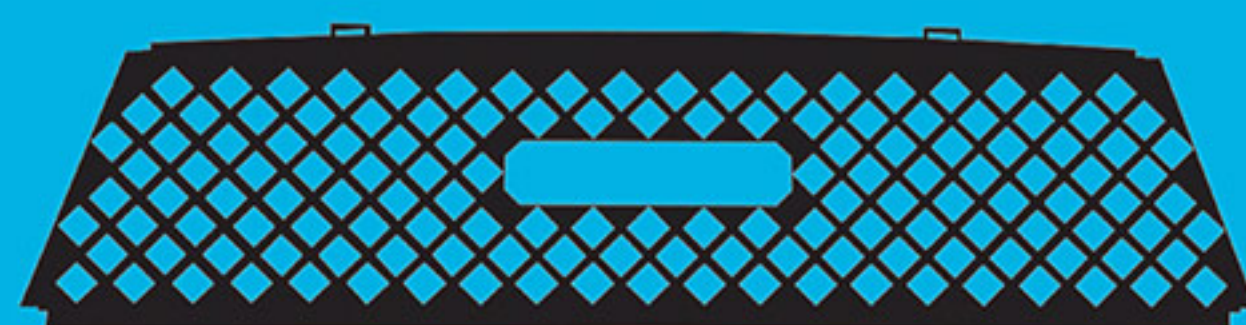
Front Window Mesh Screen

Heavy load you need Super Springs The best anti-sway suspension and load stabilisers on the market today.