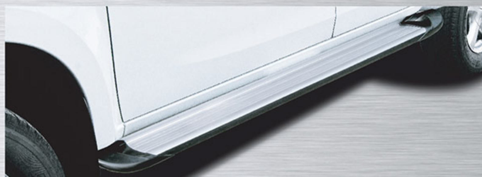
CB-554 Set Aluminium side step available in 68", 78" and 83" length.

* 1" = 2.54cm / 3" = 7.62cm / 68" = 172.72cm 78" = 198.12cm / 83" = 210.82cm / 85" = 215.9 cm.