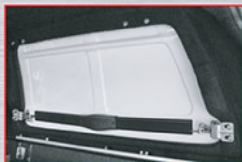
Double Layers Fiberglass Side Doors.