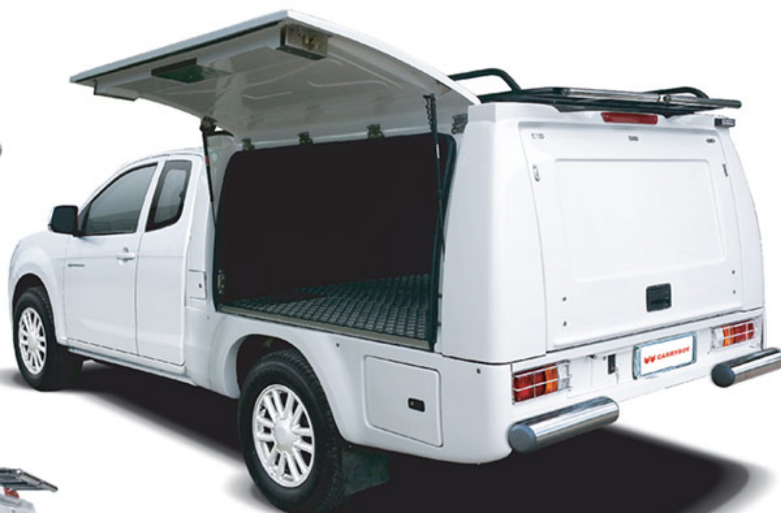
CIRC-CSV / Extended Cab