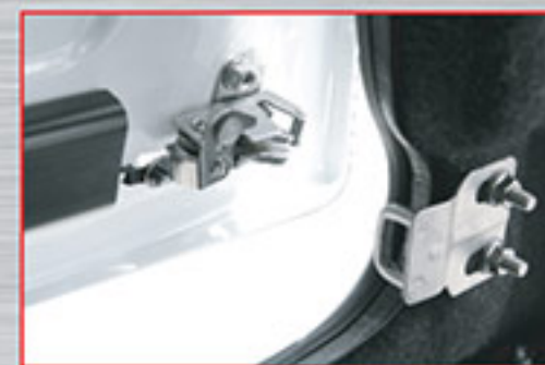
Stainless Steel Rotary Lock and Latch System.