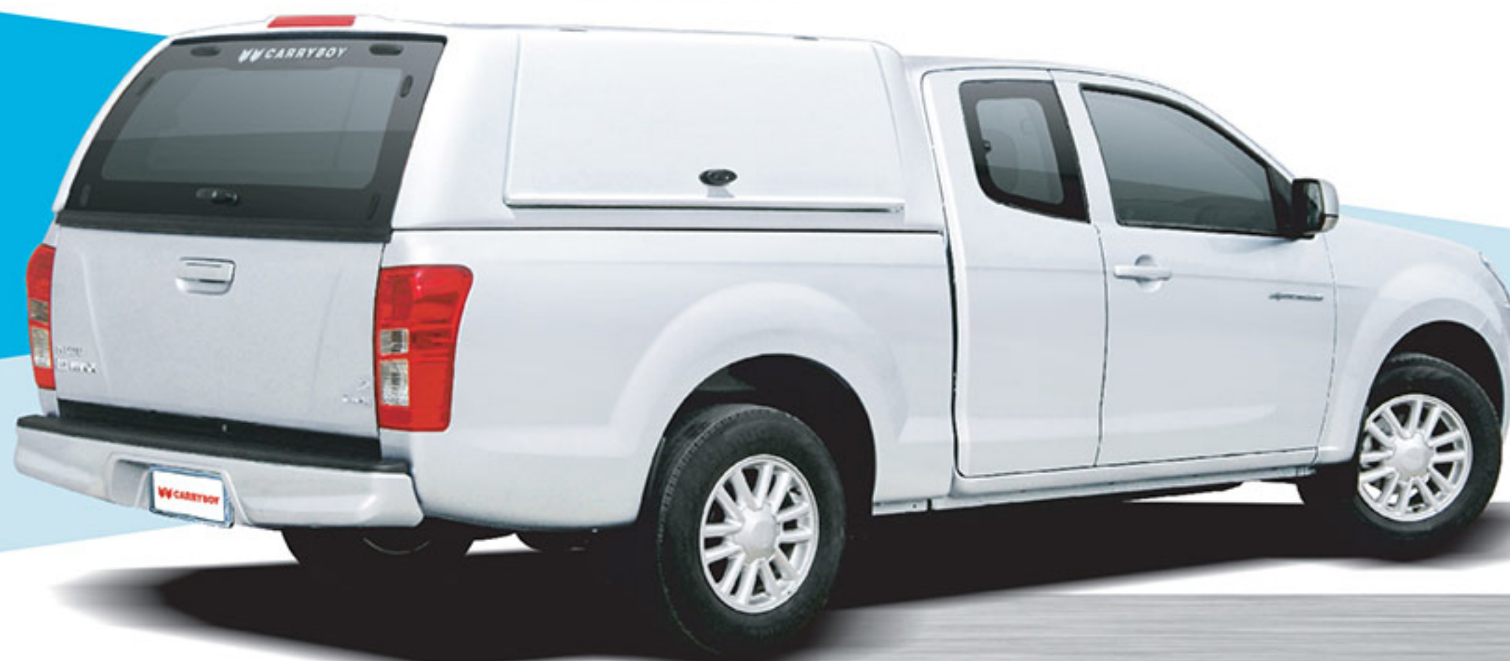
CIRC-WM / Extended Cab