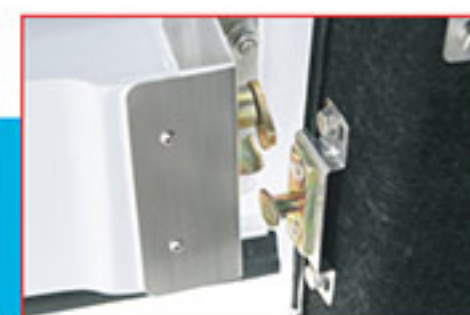
Durable and Strong Rotary Lock System.