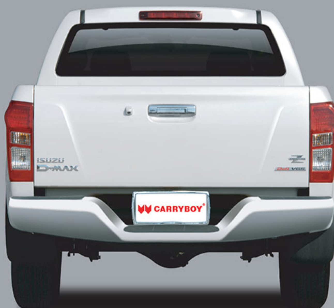
S-110 Rear Nudge Guard Produced from high grade stainless steel or metal chrome plate available.