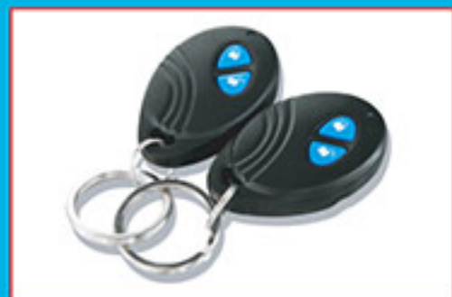
CIRL-CSV / Single Cab

Central Locking (Optional) Keyless remote control for easy lock and unlock.