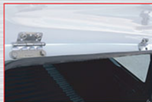
Quality Stainless Steel Hinges