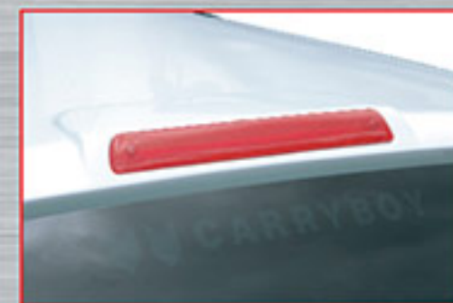
High Mounting L.E.D. Brake Light.