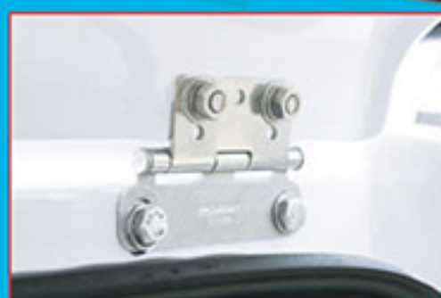
Stainless Steel Hinges.