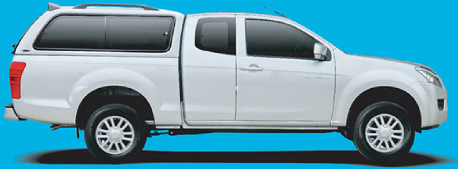
CIRD-S560 Double Cab. CIRC-S560 Extended Cab. CIRL-S560 Single Cab.