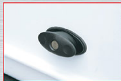
Injected Door Handle with Lock and Key.