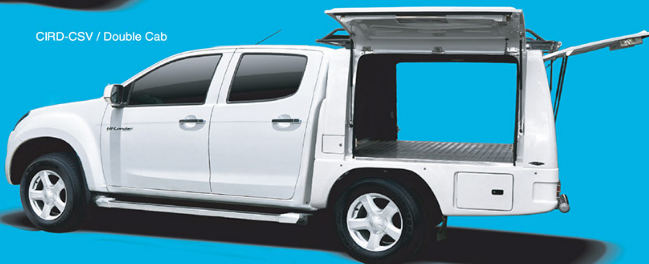
CIRD-CSV / Double Cab