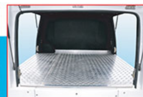
Aluminum Checkered Plate Floor.