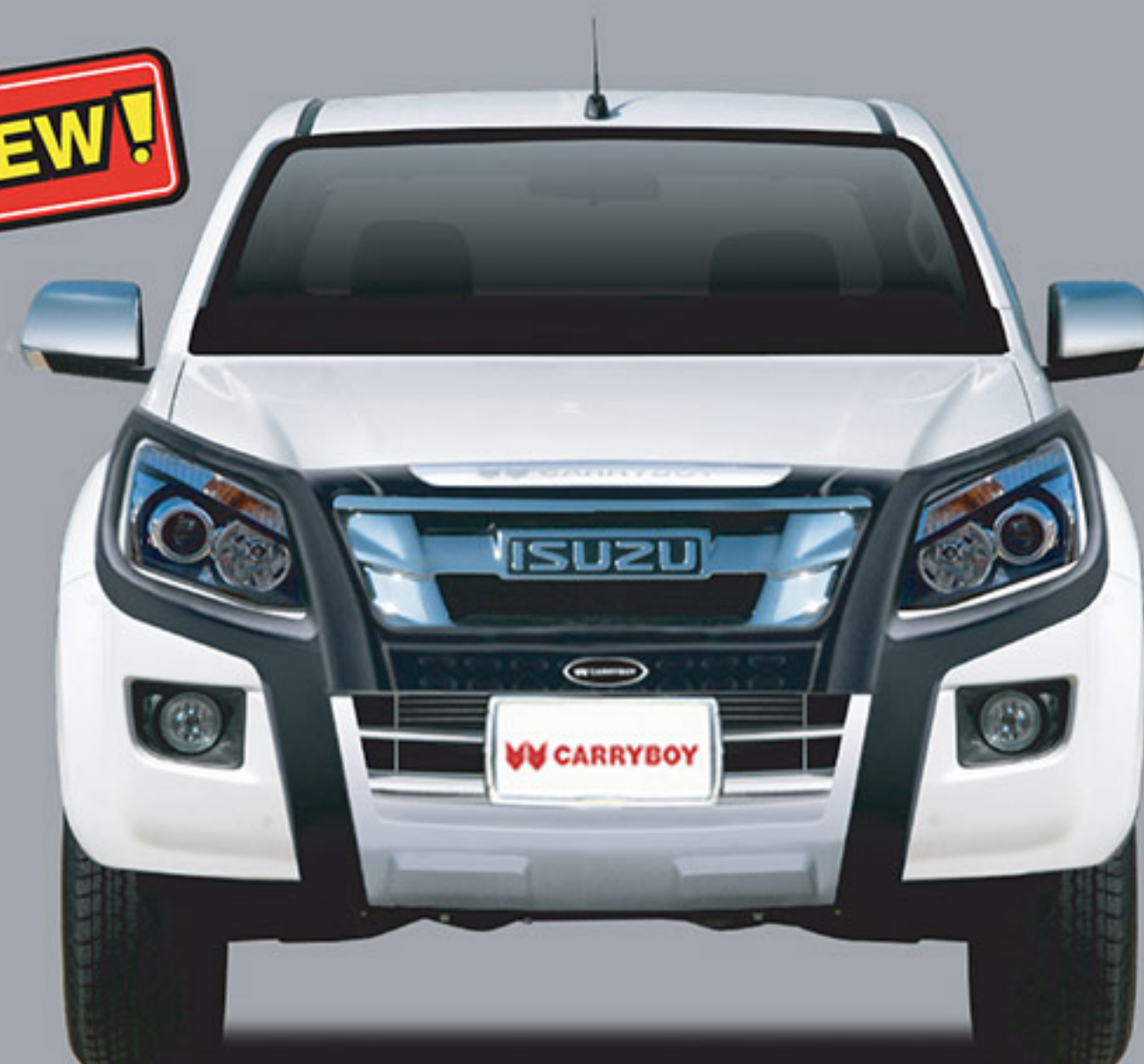
CB-709 Curve Wing Polyurethane Produced from high grade polyurethane with the latest full guard design to protect your head lights with RTM skid plate.