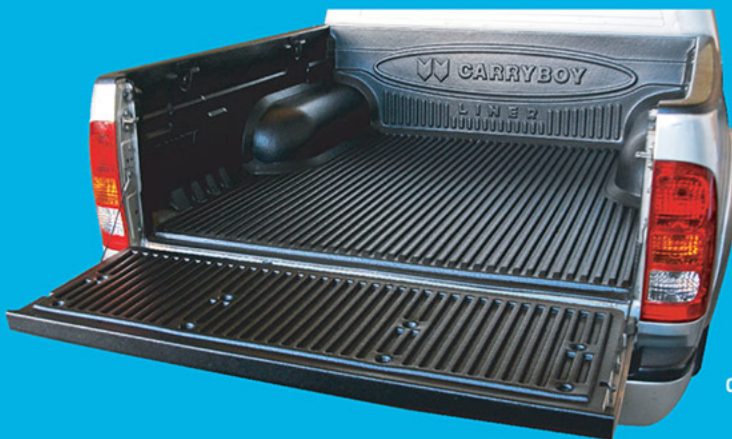
CB-920 Ute Liner