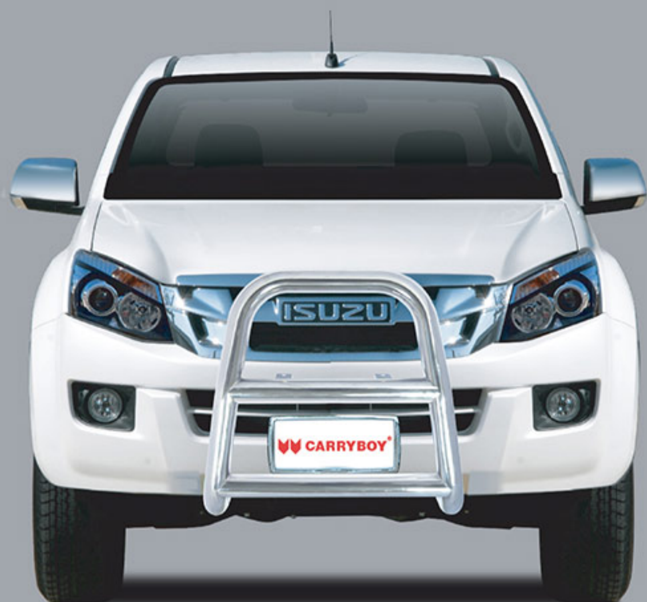
CE-544 A Bar Front Nudge Guard Produced from high grade stainless steel tube ( TP 201/TP 304 ) Ø3" available to fit spot lamp 8 "