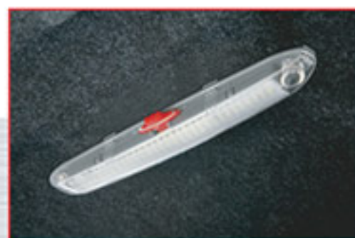
L.E.D. Interior Light with on-off switch.